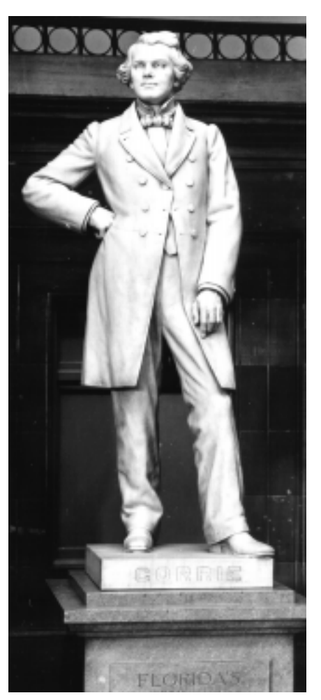
Figure 4: 1913 Statue of John Gorrie by C. Adrian Pillars in the Statuary Hall, Capitol Building, Washington.

In the days of the second month We cut out the ice with great blows singing d'iong-d'diong-d'dion. In the days of the third month We cart the blocks to the ice houses