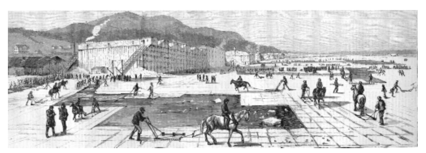
Figure 1: Ice crop on the Hudson; Harper's Weekly, March 7, 1874.