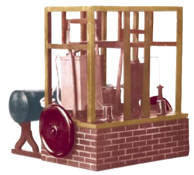
Figure 3: A model of Gorrie's ice machine from the John Gorrie Museum in Apalachicola, Fla.

Writing in the Apalachicola Commercial Advertiser in 1844 under the nom de plume "Jenner," Gorrie proposed that "the houses of warm countries be built with equal regard to insulation, and a like labor and expense be incurred in moderating the temperature and lessening the moisture of the internal atmosphere," to reduce the threat of malaria. He theorized that elevated temperature and high humidity "prevents a large portion of the human family from sharing the natural advantages